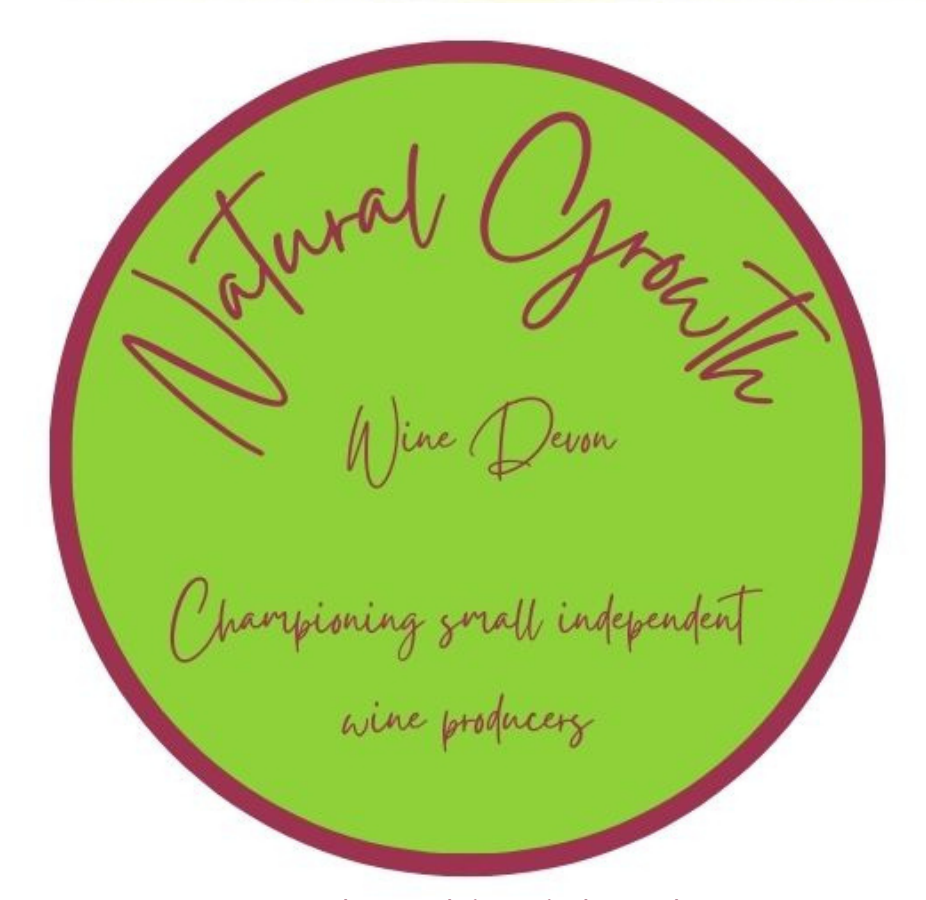
Natural Growth is an independent importer based in Devon

Proud to introduce some of the hardy souls who put their love and life's work into the bottle to deliver a unique and inspiring product. Believing in agriculture that is at the origin of everything, spontaneity and growth that is not forced.